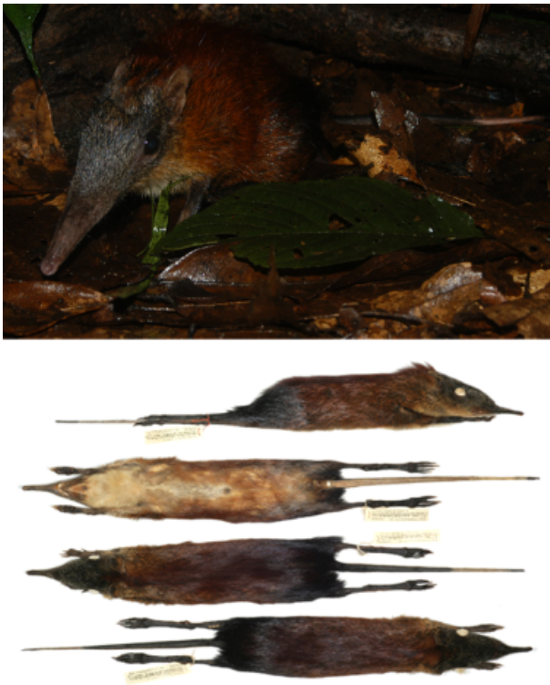
Figure 2 Photographs of Rhynchocyon udzungwensis sp. nov.: above, captive live animal (holotype, CAS 28043); below, four specimens (three paratypes and holotype) prepared as study skins. From top to bottom: BMNH 2007.7, FMNH 194127, MTSN 6000, CAS 28043. BMNH, British Museum of Natural History; CAS, California Academy of Science; FMNH, Field Museum of Natural History; MTSN, Museo Tridentino di Scienze Naturali.

denser, fluffier and greyish or brownish fur of the Macroscelidinae. The first 2 cm of the exceptionally long nose are essentially naked and black. The hair on the sides and top of the face back to the base of the ears has black bases and cream to pale white tips, giving a grizzled grey appearance. A maroon nuchal crest 2–2.5 cm high, about 1 cm higher than the ear crowns, starts between the ears and extends back about 3 cm. The maroon colour of the crest encroaches about 1 cm into the grey pelage of the forehead and forms an indistinct stripe that widens along the back from behind the ears to the rump, where it narrows and integrates with the jet-black fur over about 3 cm to a point about 3 cm above the tail insertion. The lower rump is jet black. In certain lights and from certain angles, two parallel slightly darker lines are barely visible within the maroon dorsal stripe, each with up to four very faint pale spots near the leading edge of the black rump. This vestigial chequering is similar to that of R. petersi and R. chrysopygus . The black rump hair is about the same length as the pelage on the surrounding areas. The jet-black fur on the lower rump extends to the upper thighs and down onto the rear legs. The fur behind the ears and on the shoulders is grizzled yellow-rufous and becomes orange-