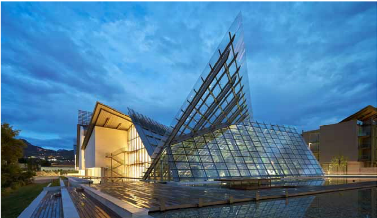
MUSE skyline looking East

MUSE, Trentino, Italian Alps Trento, Italy